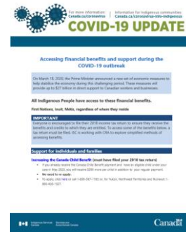
Accessing Financial Benefits and Support During the COVID-19 Outbreak

https://indigenousnurses.ca/sites/default/files/inline-files/COVID-19-Accessing-financial-benefits-and-support.pdf