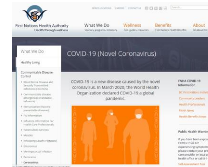
COVID-19 (Novel Coronavirus) Website

https://www.bcafn.ca/sites/default/files/docs/reports-presentations/Covid_Reources_V3_It15_pages.pdf