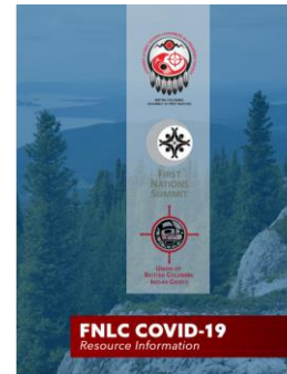
FNLCOVID-19 Resource Information

https://indigenousnurses.ca/sites/default/files/inline-files/COVID-19-Accessing-financial-benefits-and-support.pdf