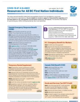
Financial Supports and Benefit Sheets At-A-Glance